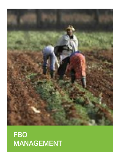
5040 (RW) 6565 (UG) 6933 (UG)