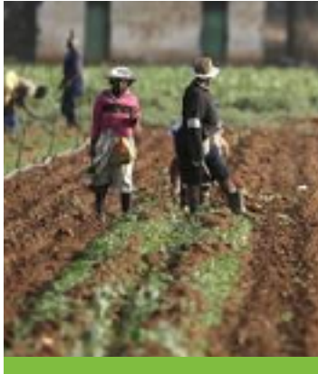
FIELD AGENT MANAGEMENT